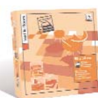
5 m 2 box = 20 Tiles