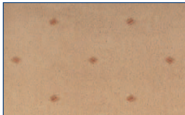
Champagne white 60