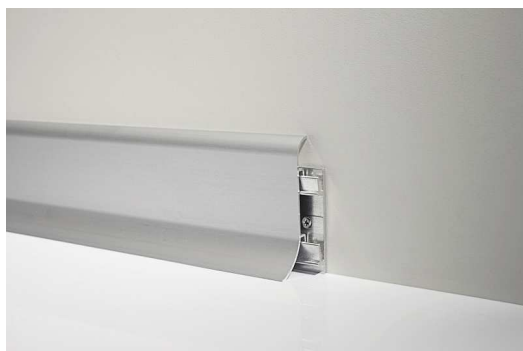
98/ 7 with base S/95