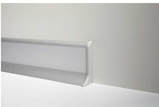
right end cap