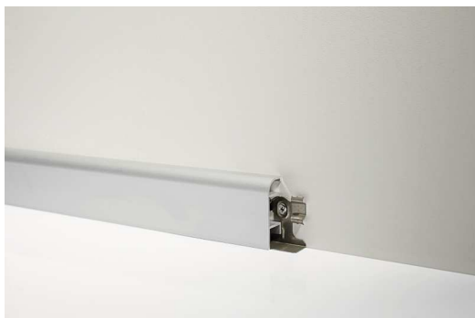
97/ 4 with base 8602/C