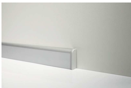
right end cap