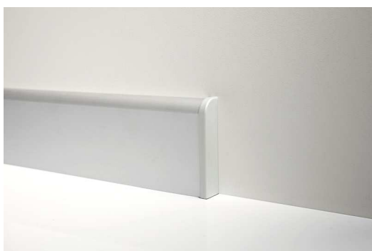
right end cap