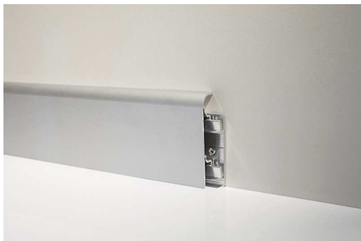
97/7 with base S/95