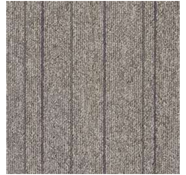
First Straightline 144