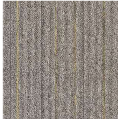
First Straightline 142