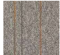
First Straightline 147