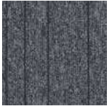
First Straightline 961