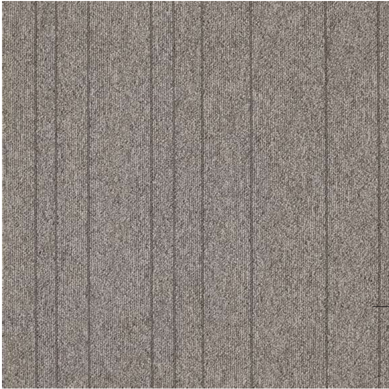
First Straightline 140