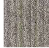
First Straightline 146