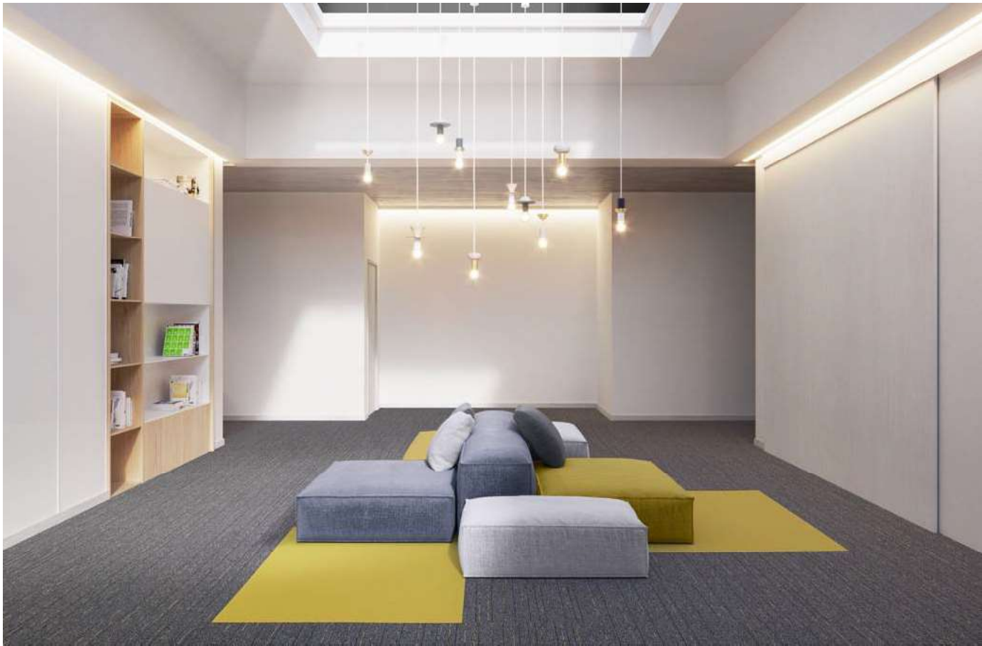
First Straightline 962, First Forward 210