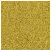
First Forward 210