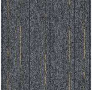
First Straightline 962

Get creative with our modulyss designer at designer.modulyss.com