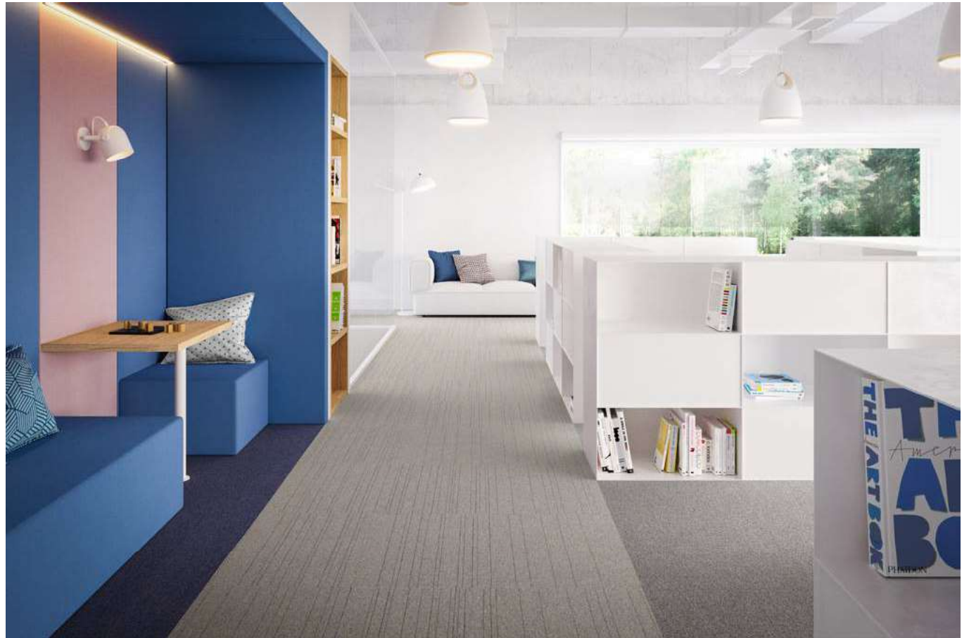
First Straightline 140, 144, First Forward 543, 817