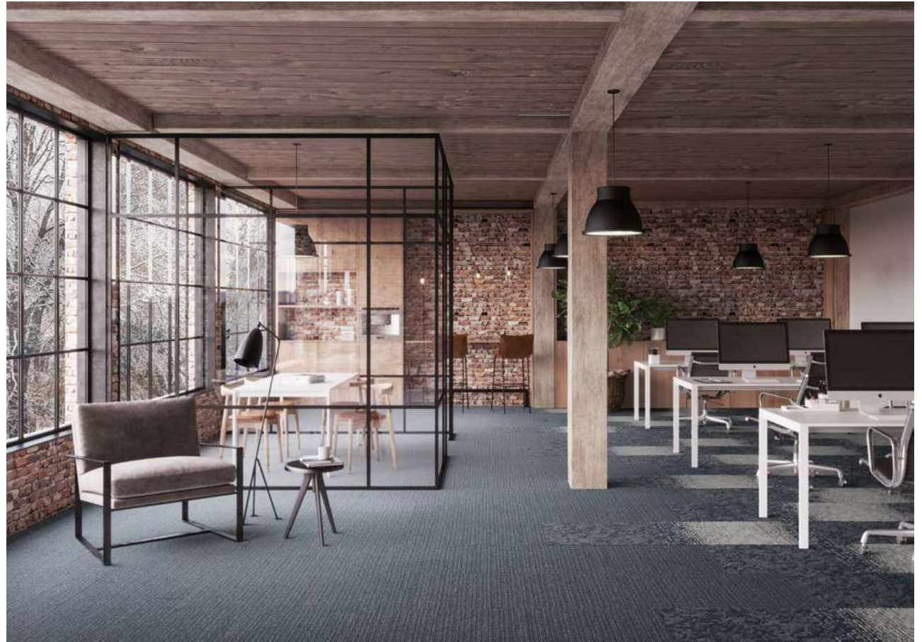
First Streamline 578, Motion 578, Vision 578

Besides being an ideal match for First Forward, the precise loop pile construction of First Streamline can also be mixed&matched with a selection of colours of Motion///Vision for playful colour gradients. A fabulous way to add flow and a pace to layouts, First Streamline lets creativity shine through.