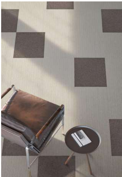
First Streamline 130, First Forward 140