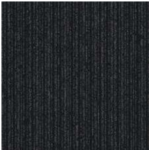
First Straightline 578