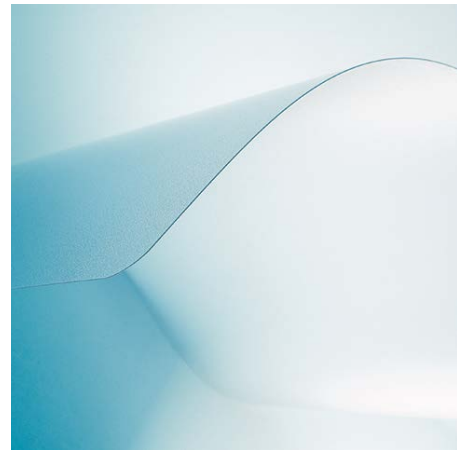
For hard floors with VAB®-antiglide layer