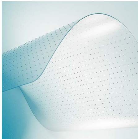
For carpets with anchor grips

The office chair glides perfectly – both over hard floors and carpeted floors. On hard floors, the high-performance, thermally welded VAB®-antiglide layer ensures that the mat cannot slip. On carpeted floors, blunt anchor studs provide grip by digging into the soft pile.