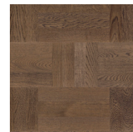
Noble Oak Wasa