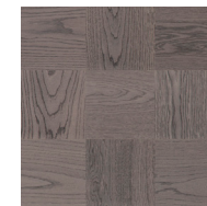
Noble Oak Bronx

The pictures only present the colour of the floor. For more details regarding grading and variations see the Grading Book or www.tarkett.com . Tarkett's international range of floors comprises many different products. Some of these may not be for sale in your country. Although every care has been taken to reproduce images that reflect the finished product, the quality of monitor and printer and the nature of wood results in variations in the color and structure of individual planks. When sanding a wooden floor the appearance will change in colour, texture and surface effects.