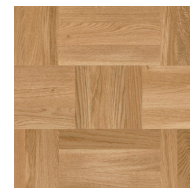
Noble Oak Classic