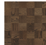
Noble Oak Chelsea