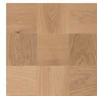
Noble Oak Soho