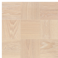
Noble Oak Brooklyn