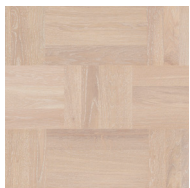
Noble Oak Scandinavia