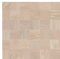
Noble Oak Manhattan