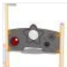
UM Play Panel