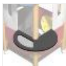
UM Sand Table

Size: Width 0.55 m Materials: Electro-galvanised and powder-lacquered steel profile console. Hob top and front panel in HPL.