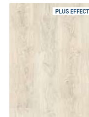
Patagonia Oak 510017004