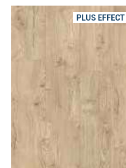
Halifax Oak Sand 510017007