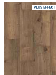
Cabin Oak Aged 510017002