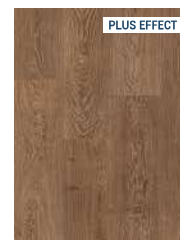
Nevada Oak 510017006