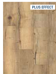
Cabin Oak 510017001