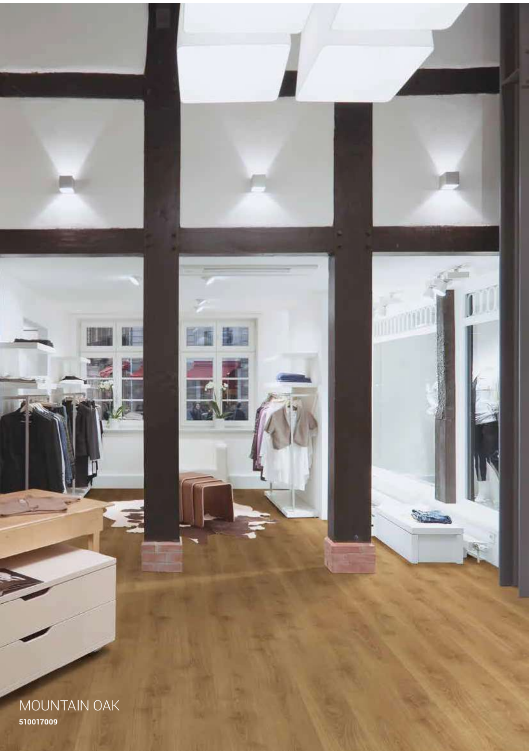
MOUNTAIN OAK 510017009