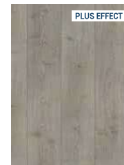
Samara Oak 510017003