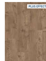
Halifax Oak 510017008