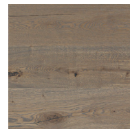
Heritage Oak Old Grey