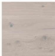
Heritage Oak Urban Grey