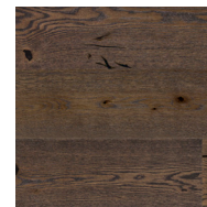
Heritage Oak Old Brown

The pictures only present the colour of the floor. For more details regarding grading and variations see the Grading Book or www.tarkett.com . Tarkett's international range of floors comprises many different products. Some of these may not be for sale in your country. Although every care has been taken to reproduce images that reflect the finished product, the quality of monitor and printer and the nature of wood results in variations in the color and structure of individual planks. When sanding a wooden floor the appearance will change in colour, texture and surface effects.