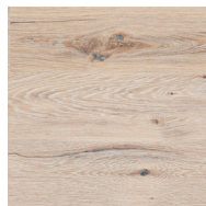
Heritage Oak Lime Stone